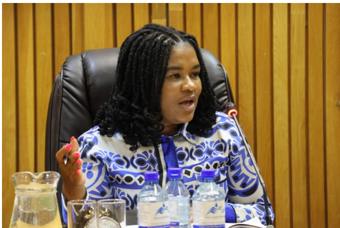
Capricorn District Executive Mayor Cllr. Mamedupi Teffo.

Lepelle Northern Water (LNW) held its second Multi Stakeholder Task Team (MSTT), chaired by the Executive Mayor of Capricorn District Municipality (CDM), Cllr Mamedupi Teffo, at the CDM Council Chamber in Polokwane.