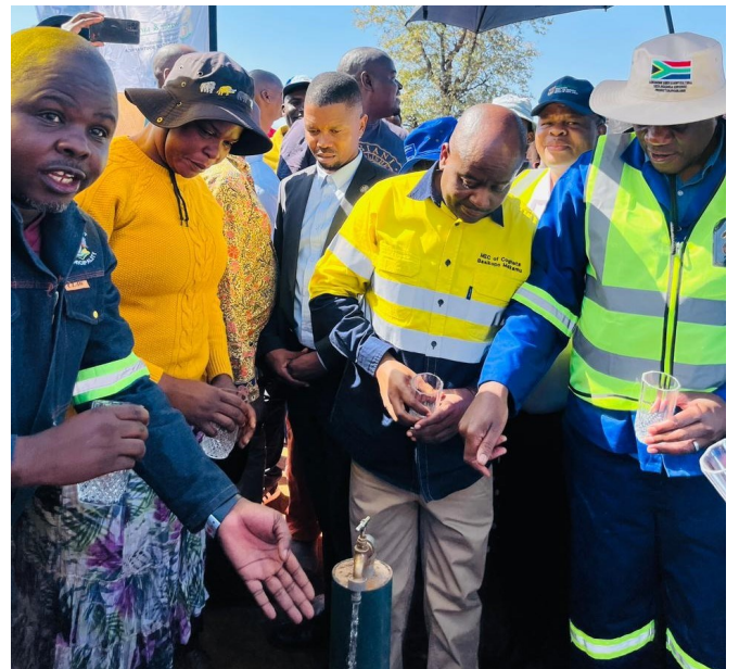
Running water from yard connections at N'wakhuwani village.

The primary goal of this project is to enhance water provision, ensuring that clean water is accessible to over 55 villages within the Mopani District Municipality.