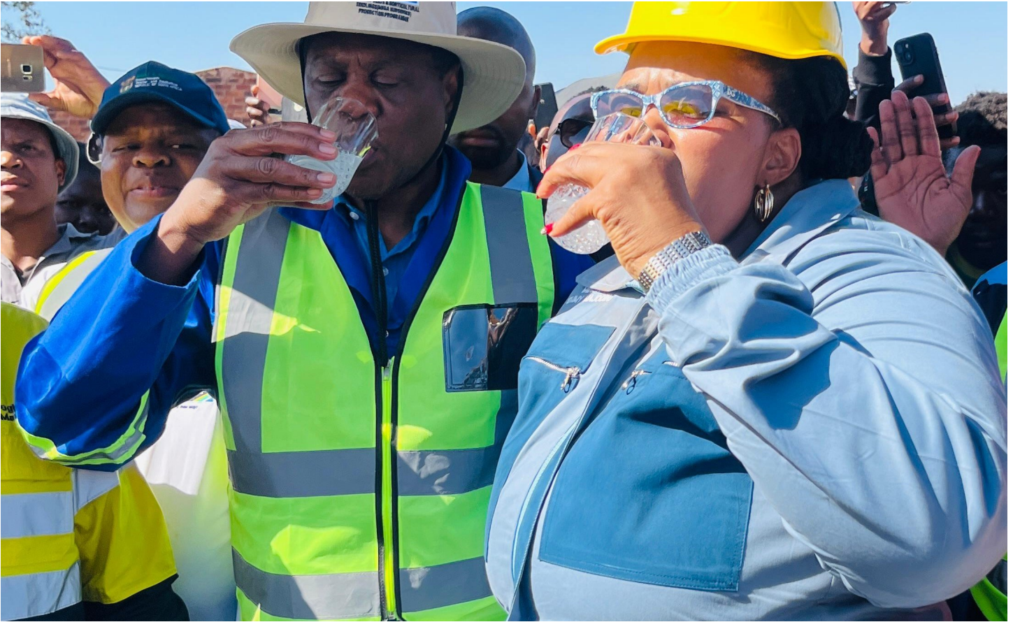
Deputy President and Minister of Water and Sanitation drinking tap water at N'wakhuwani village.

Deputy President Shipokosa Paulus Mashatile, in his capacity as Chairperson of the Task Team addressing water challenges across the country, alongside the Department of Water and Sanitation Ministry, conducted an oversight visit to assess progress on various intervention projects aimed at improving water services in the Greater Giyani Local Municipality. He was accompanied by the Acting Premier of Limpopo Province, Mr. Basikopo Makamu, members of the Limpopo Provincial Executive Council, District and Local Mayors, and representatives of Traditional leadership.