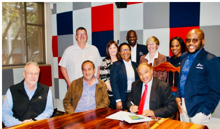
LNW signs MoU with University of Free State.