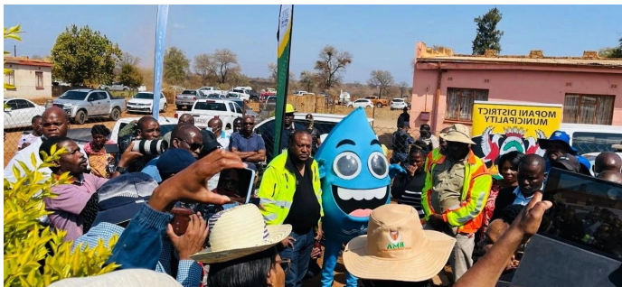
Lepelle Northern Water team participated at the launch.

This continuous campaign will focus on evaluating the state of water services and supporting communities particularly in rural areas in the province affected by lack of water, to be led by Limpopo Office of the Premier.