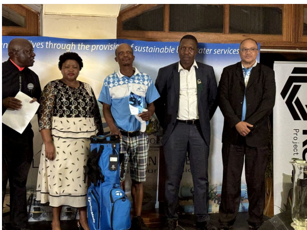
Lepelle Northern Water (LNW) charity Golf challenge for a good cause.