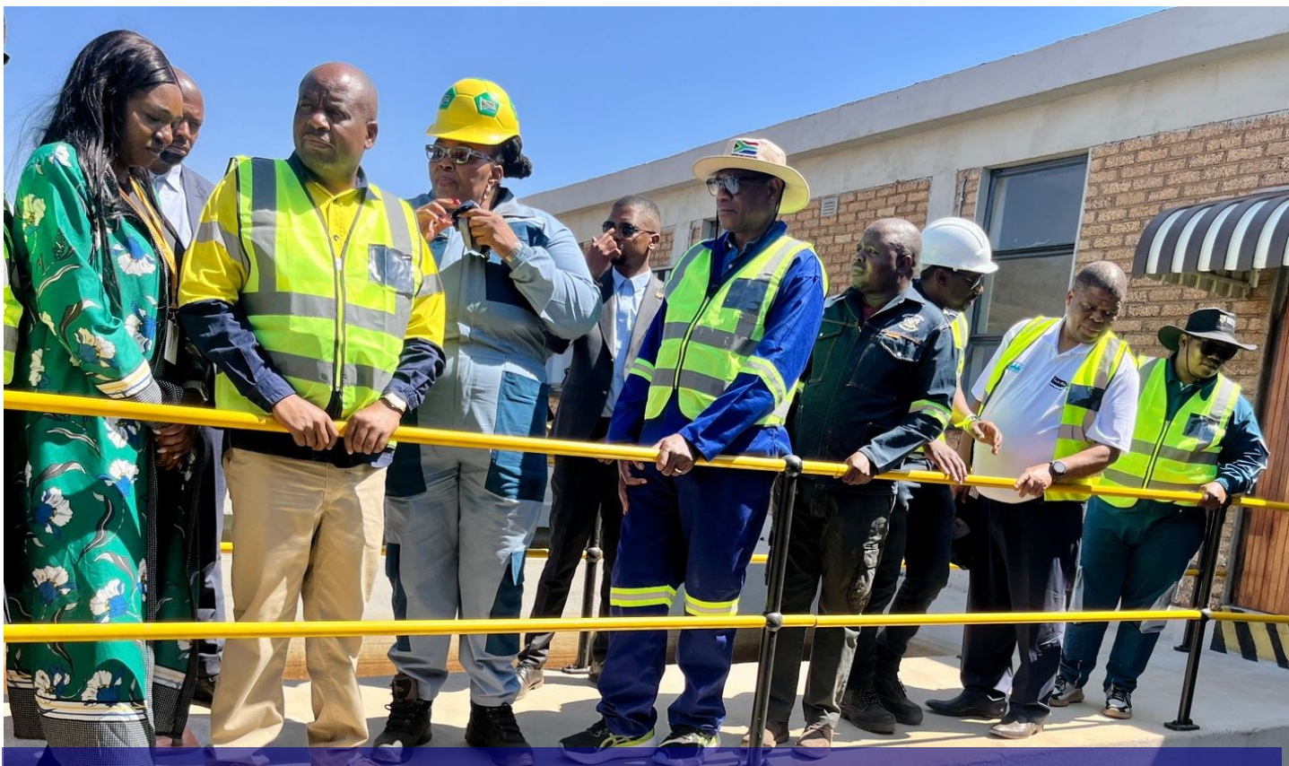
Deputy President Paul Mashatile alongside the Department of Water and Sanitation Ministry members of Provincial Executive Council, District and Local Mayors at Giyani Water Treatment Works.